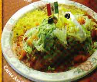
Carne Asada Burrito