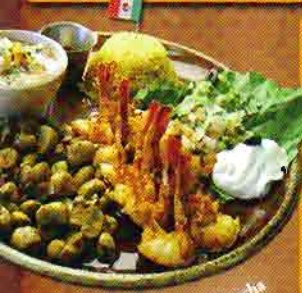
Camarones a la Plancha